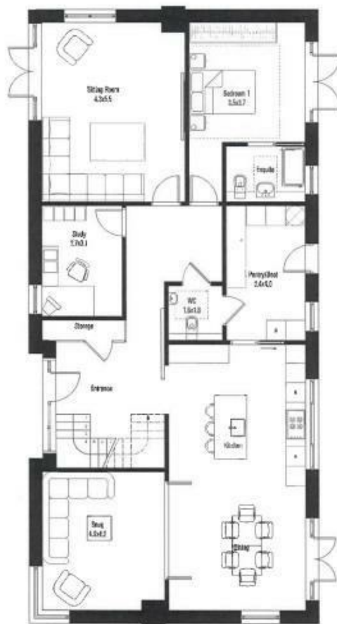
Ground Floor GIA 143 SQM