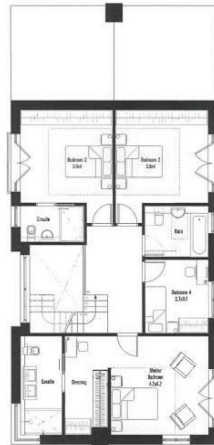
First Floor GIA 98 SQM

171 High Street, Dorking, Surrey, RH4 1AD Tel: 01306 877775 Email: dorking@patrickgardner.com www.patrickgardner.com